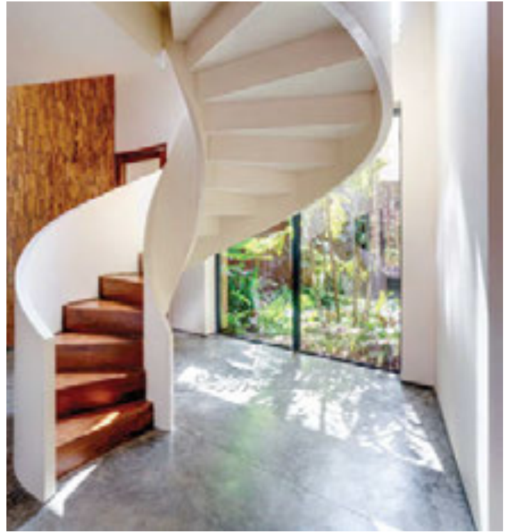
Each portion reflects the untouched natural lushness that peeps in beautifully