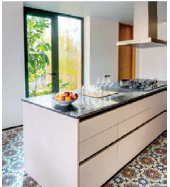
Portuguese style tiles laid in Terra kitchen makes the ambience look luxurious