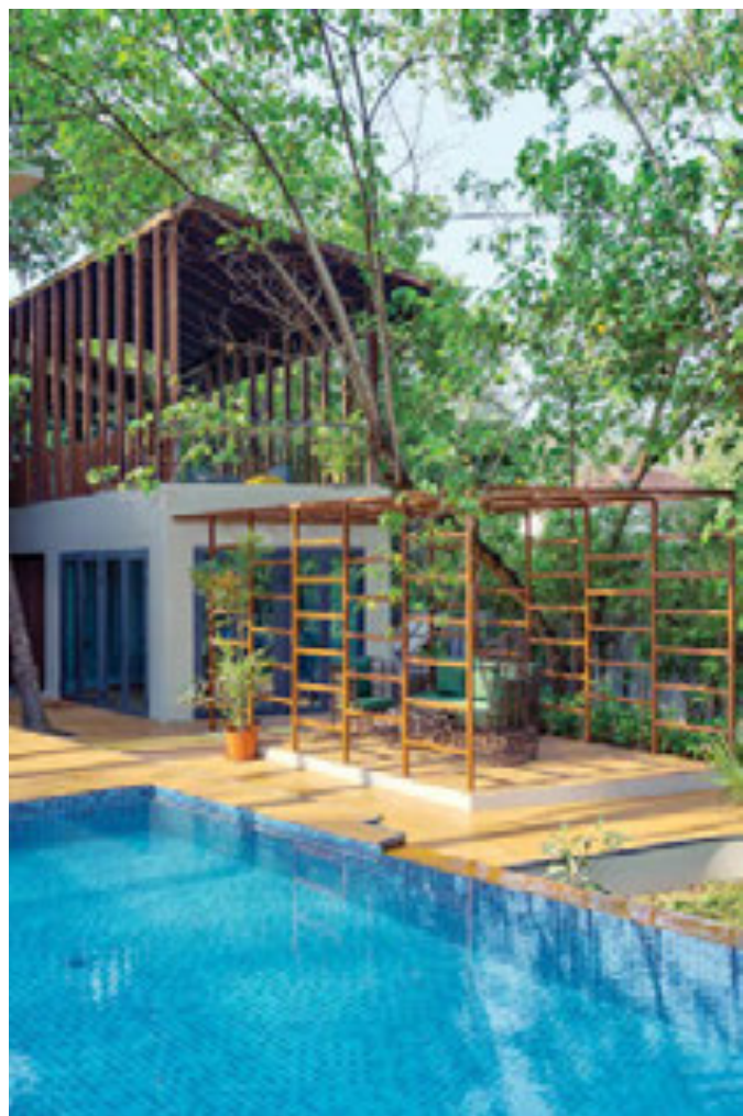
Lavish pool complementing the sprawling garden