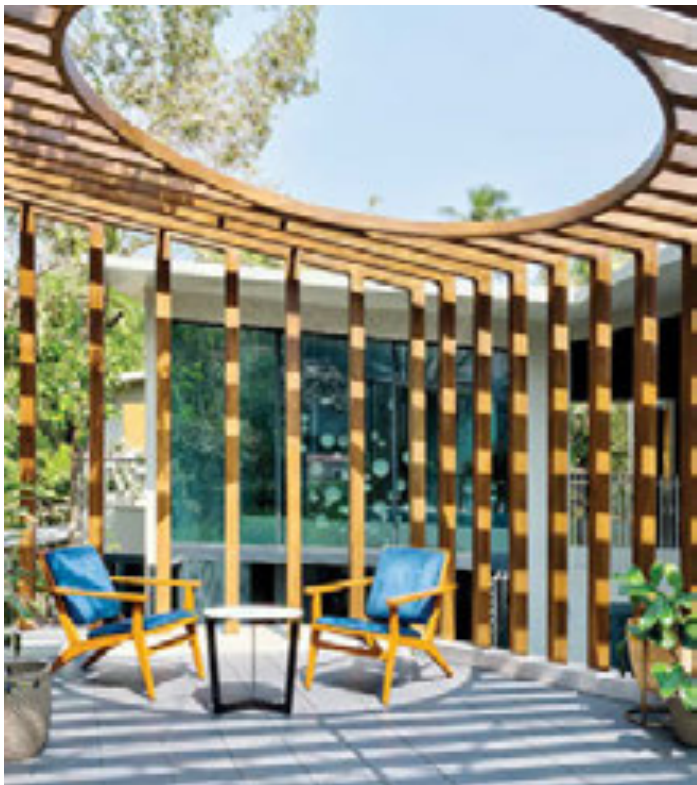
Lua ensures a sense of romance & excitement as one walks through the house