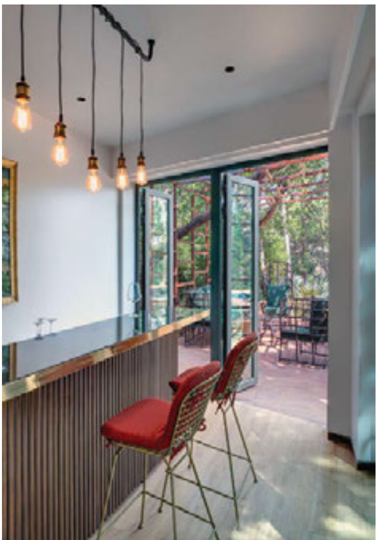
Opulent outdoor gazebo in the western part of the property