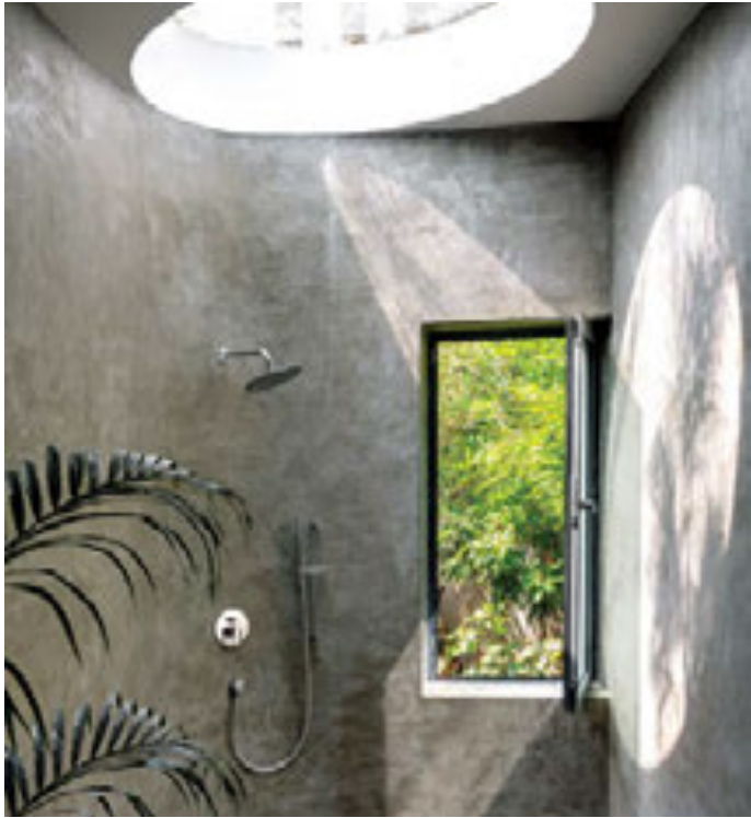
Bathroom with natural light fill up the space