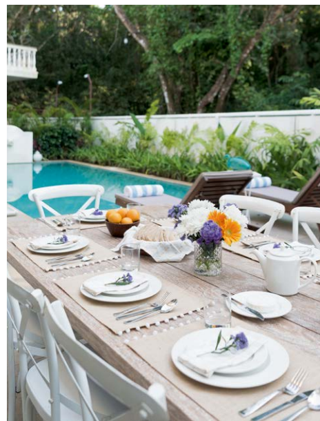
(Clockwise from top left) A bedroom, the observatory deck, and façade of the Moon House; al-fresco dining, and a bedroom at Igreha Vaddo, Siolim.